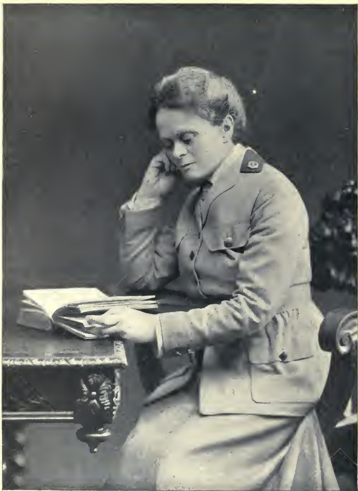
DR. ELSIE INGLIS, 1916